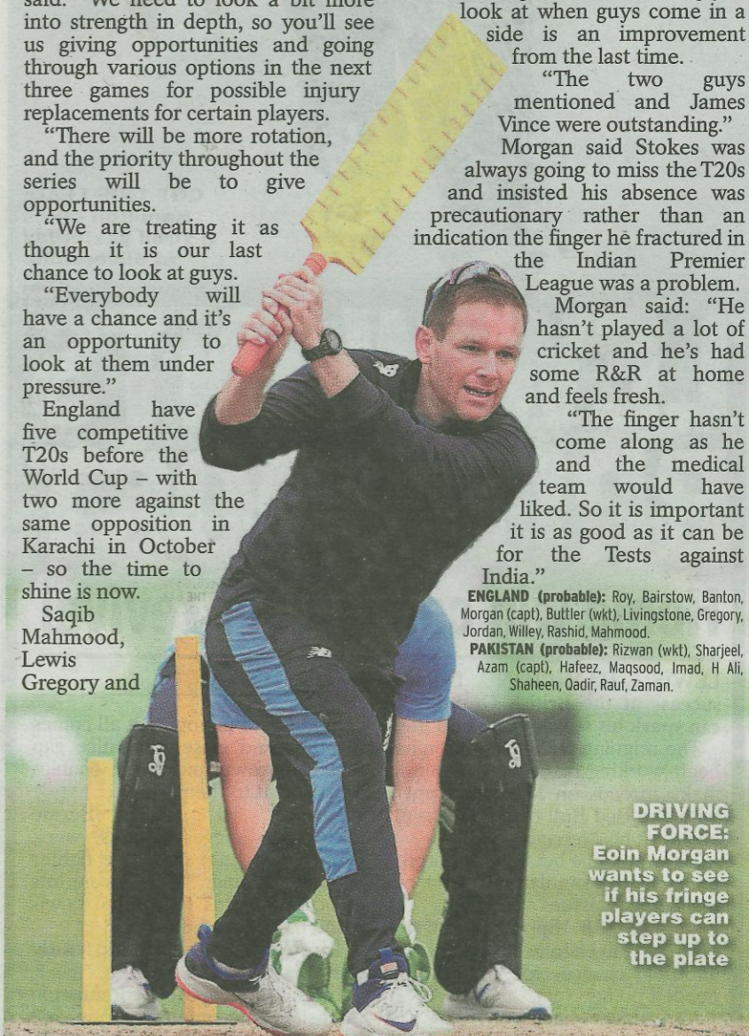
DRIVING FORCE: Eoin Morgan wants to see if his fringe players can step up to the plate

PAKISTAN (probable): Rizwan (wkt), Shaheen, Qadir, Rauf, Zaman.