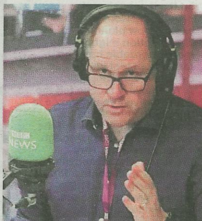
Report...Henry Dimbleby yesterday

Dimbleby, who led the National Food Strategy, wants a sugar and salt reformulation tax.