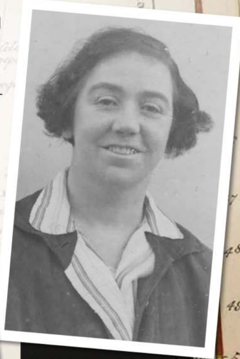
Fig 1 A passport photograph of Maude Carey—the first female postmaster of the British Empire

In 1934 Ellen Maude Carey became the Colonial Postmaster of the Falkland Islands, thus becoming the first female postmaster of the British Empire. A collection of letters written by her in the 1930s offers a unique insight into the daily lives of post-office workers on the island. Albert-Friedrich Gruene reveals how one such letter, concerning the 1937 Coronation omnibus issue, gives a vivid impression of what the event meant for the post-office staff in Stanley.