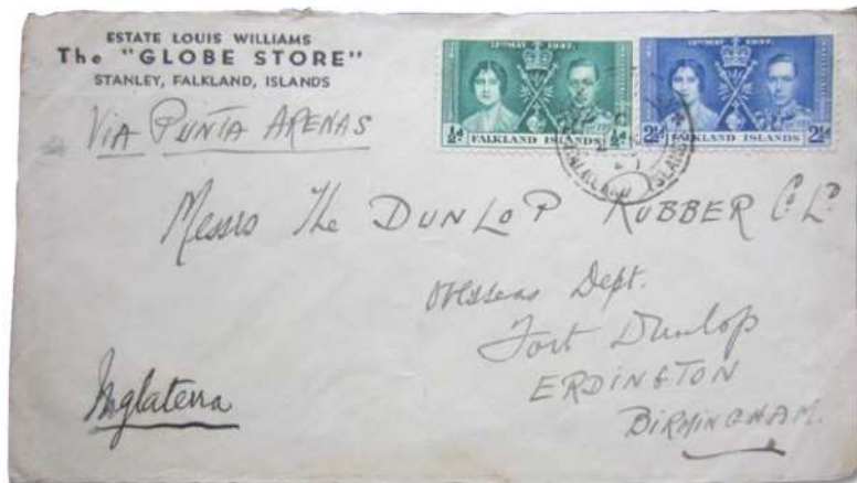
Fig 9 A commercial Coronation cover to the Dunlop Rubber Company from the Globe Store, Stanley (Reduced)