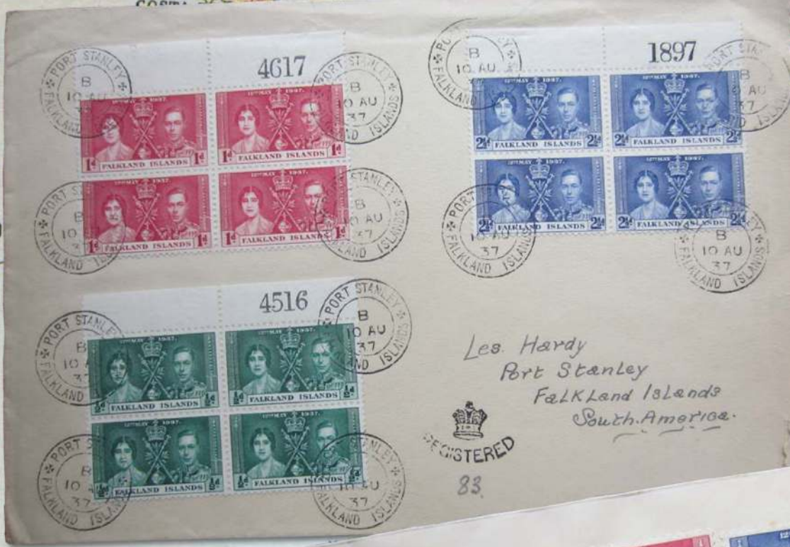
Fig 10 A Coronation cover showing individual sheet numbers on blocks of four (Reduced)