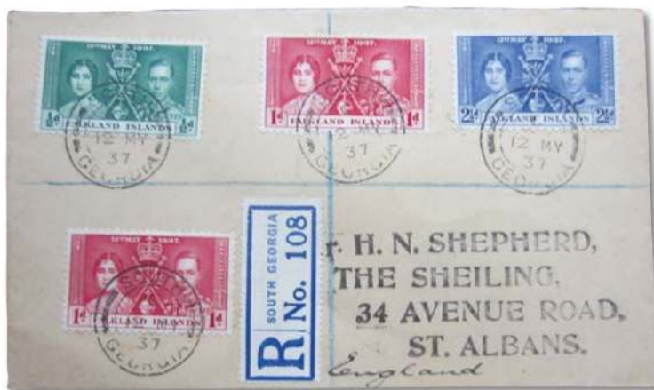
Fig 7 A Coronation cover from South Georgia with a normal registration label (Reduced)