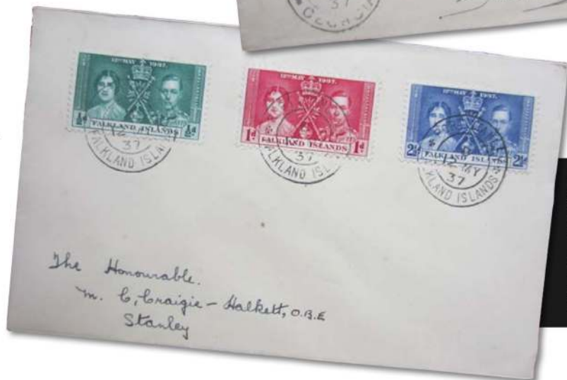
Fig 6 A Coronation f.d.c. cover addressed to the Governor of the Falklands (Reduced)

opportunity to pick the ones in which specialised collectors have an interest. There is so much material available that you can often make interesting discoveries. Fig 4 shows an example of a late Coronation cover from 1944 cancelled in Stanley with Fox Bay registration label in which 'Fox Bay' has been crossed out by blue crayon. Apart from covers which bear an interesting destination (Fig 5) or show a correct commercial use, I have specialised over the years in Coronation covers which bear addresses of interesting personalities living in the Falkland Islands (Fig 6).