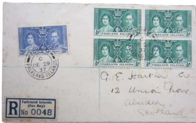
Fig 8 A Fox Bay Coronation cover cancelled by Postmaster McLaren (Reduced)