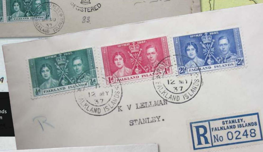
Fig 11 A Coronation f.d.c obtained by Karl Vernon Lellmann with Falkland Islands registration label rather than the provisional registration crown handstamp