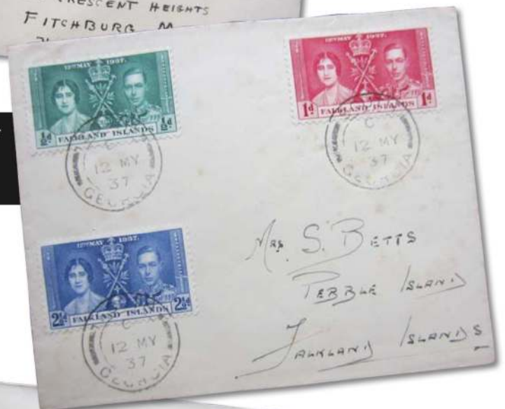
Fig 5 A Coronation cover from South Georgia to Pebble Island West Falkland (Reduced)