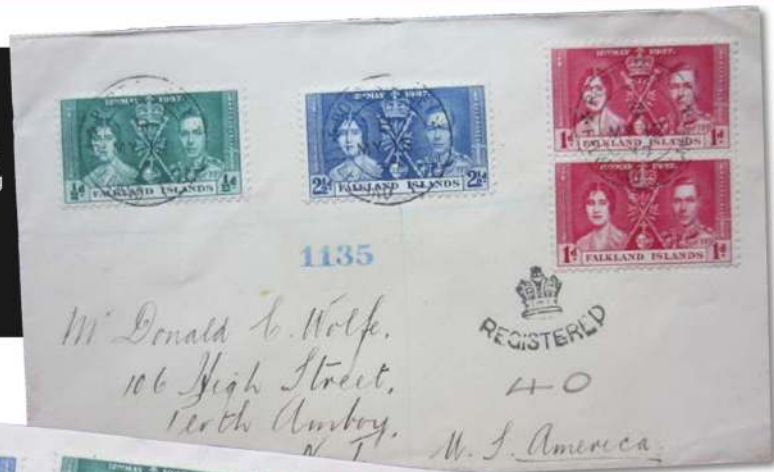
Fig 3 A Falkland Islands Coronation issue f.d.c. mailed to the USA featuring the neat handwriting of Maude Carey and the provisional registration crown handstamp (Reduced)

From her letter to Bernhard Grant, we can see that Maude Carey was often straightforward in her views. Personally, I don't agree that the Coronation 'First Day Covers are an infernal nuisance and ought to be burned' (but I have to confess I had not to deal with them). She was certainly right that the market was flooded by them. If you look for Coronation covers nowadays you always find a good selection, mostly at moderate prices. In my opinion this is a great